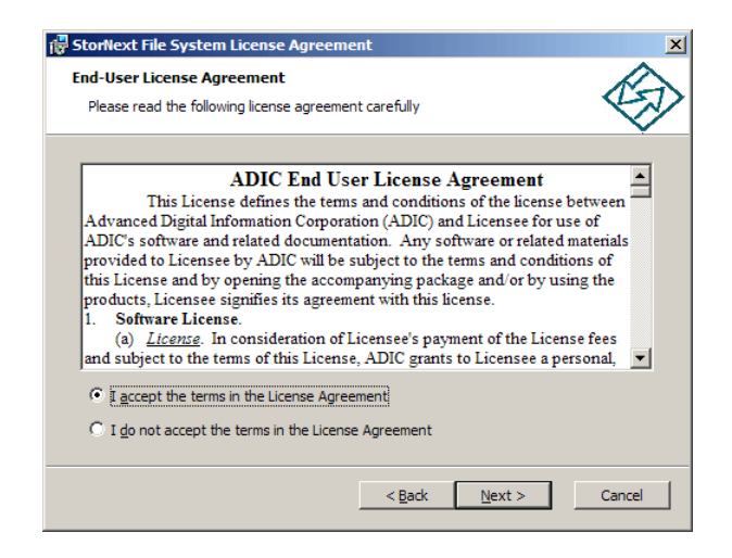
Figure 7 SNFS Setup: End-User License Agreement

5 Click the option to accept the license agreement, and then click Next to continue.