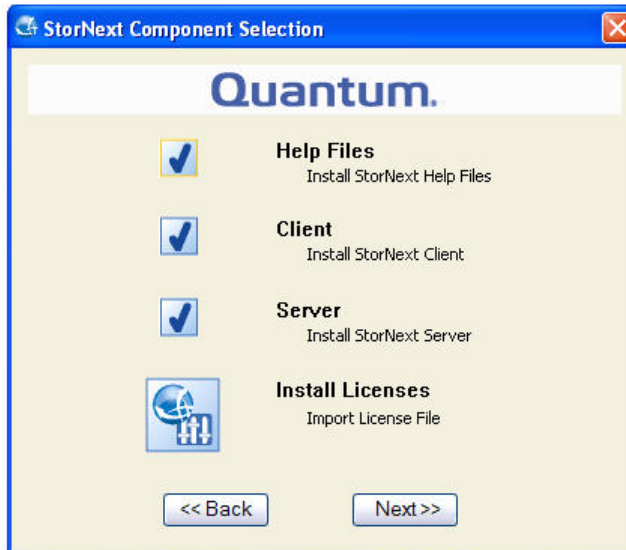
Figure 4 Component Selection