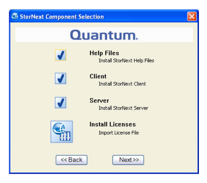
Figure 4 Component Selection

6 Select the check boxes of the components you want to include in the upgrade. Clear the check boxes of the components you want to exclude. Click Next to proceed.